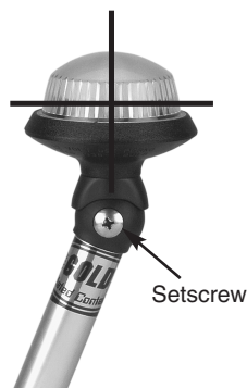
Note: Clear Globes Must Be Vertical During Operation.